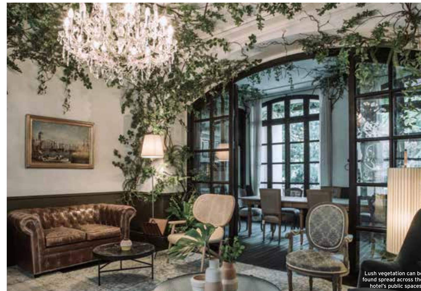
Lush vegetation can be found spread across the hotel's public spaces.

Beyond the beaches of Palma de Mallorca lies Can Bordoy Grand House & Garden, a timeless haven celebrating the island's lush botanicals and Mallorcan traditions. By Jessica Chan