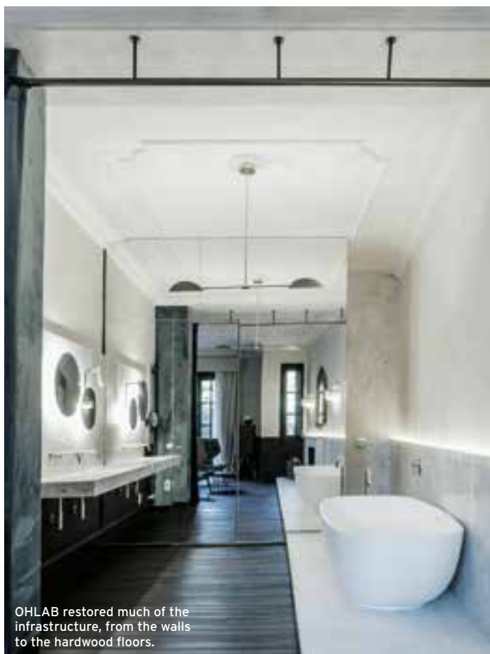
OHLAB restored much of the infrastructure, from the walls to the hardwood floors.