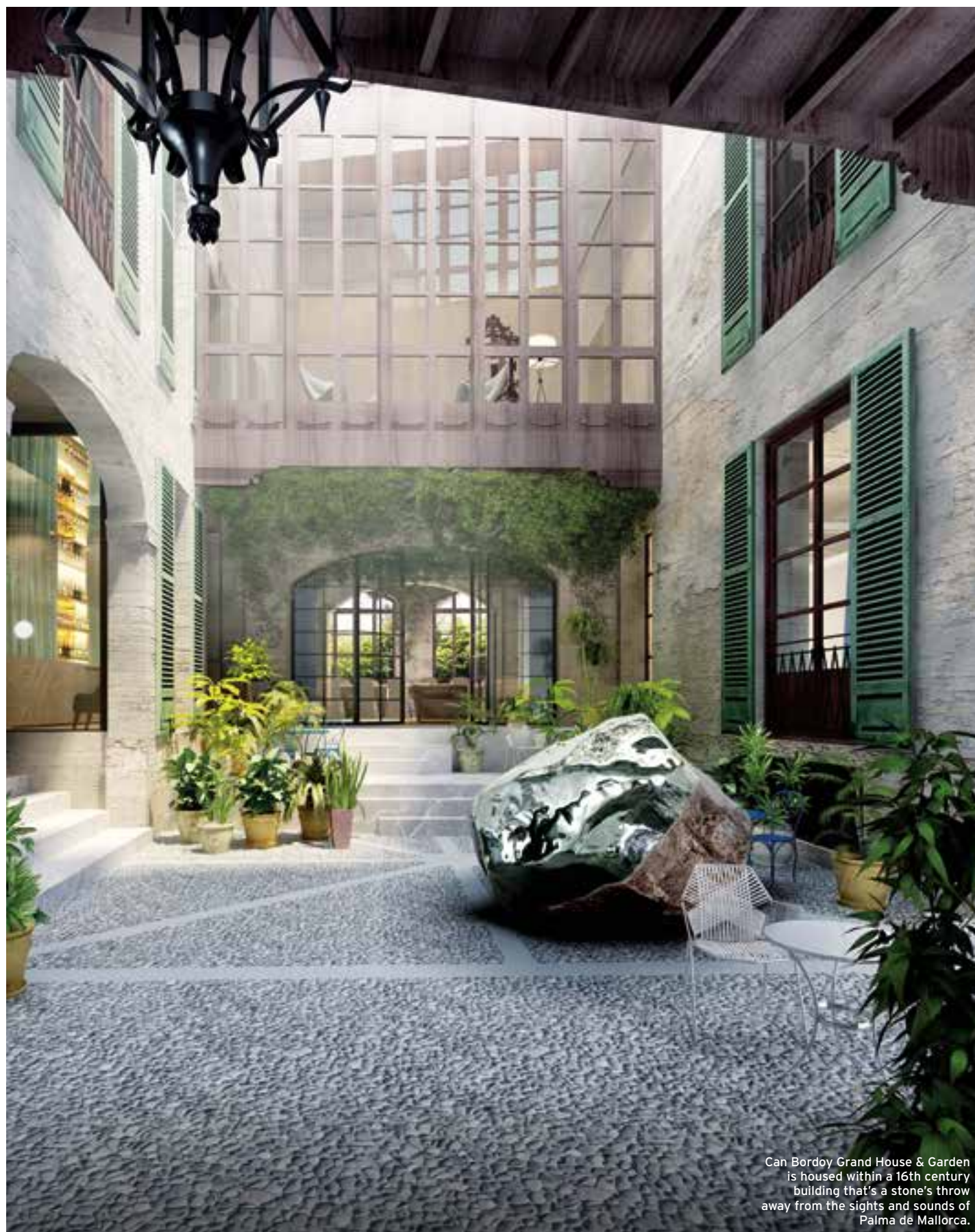
Can Bordoy Grand House & Garden is housed within a 16th century building that's a stone's throw away from the sights and sounds of Palma de Mallorca.