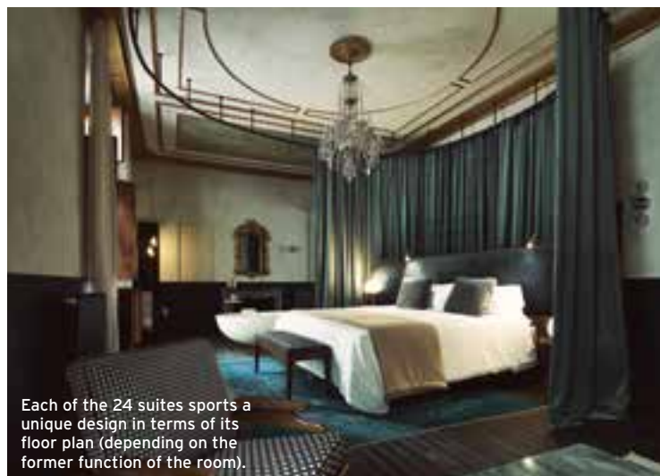
Each of the 24 suites sports a unique design in terms of its floor plan (depending on the former function of the room).